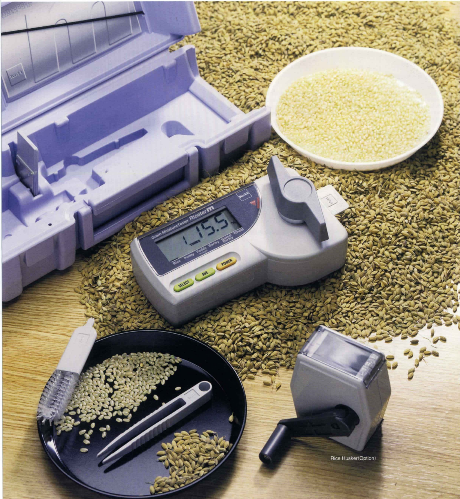
Rice Husker (Option)